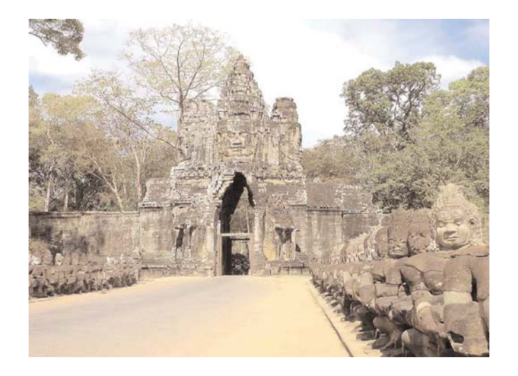
Figure 2 - Many sculptures at Angkor Wat, Cambodia, have been damaged by looters.

Within the last few years a frightening quantity of bronzes and terra-cotta figures from archaeological sites in China, as well as decapitated heads from architectural sculptures and friezes from India, Nepal and Cambodia, have surfaced on the international art market. Many artefacts are being sold in their "as-found" condition, that is, partially covered with accretions and dirt, to reassure collectors who are wary of buying fakes.