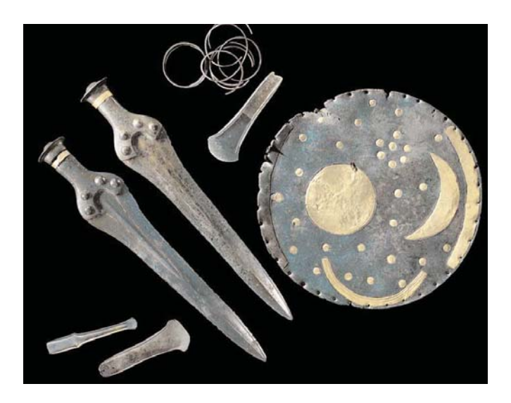
Figure 1 - A hoard of objects, including the "Sky Disc of Nebra", looted in Germany and recovered in Switzerland.

Ironically, major market countries are themselves becoming source countries. The U.S., for example, reports a steep rise in the plundering of sacred burial sites of its indigenous populations and the U.K. is losing much of its archaeological heritage to treasure hunters. Germany's archaeological sites are also at risk, as exemplified in the fortunate recovery in 2002 of a hoard of Bronze Age artefacts, including an important "sky disc".