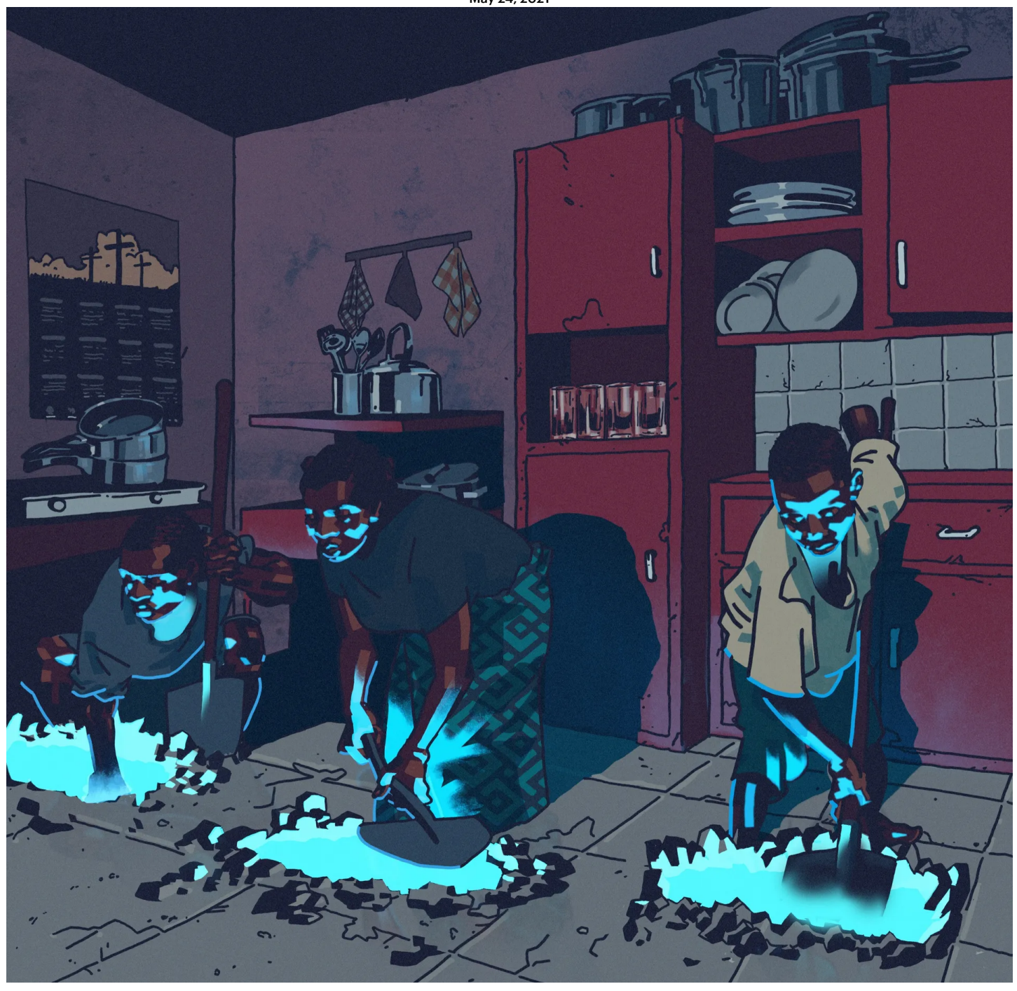
After cobalt was discovered beneath one neighborhood, Congolese began digging under their houses. Some tunnels extended into neighbors' properties. Illustration by Pola Maneli