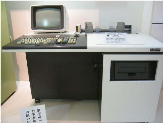
Figure 3. The JW-10, the first Japanese word processor (Toshiba Science Museum, Kawasaki, Japan). Improving Japanese language computer interfaces was a major goal of the FGCS project.

Extensive planning for the FGCS began in the late-1970s, and it included consultations with Feigenbaum and other Western AI experts. When the project was announced at an international conference in Tokyo, 1981, Feigenbaum gave an invited keynote, praising the project's prospects and even calling for more international collaboration. 25 Yet immediately after returning to the United States, he began traveling to computer science departments around the country at his own expense to raise alarms about the threat the Japanese project posed. 26 Kicked out of Eden, starved of funding, and stripped of the right to make promises about AI, Feigenbaum could still make threats—and a threat is just as good as a promise. Both are statements about the future that commit the speaker to course of action.