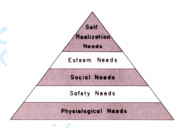
Ablished rendition of "Mas. Amid, 1960) Figure 2. Probably the earliest published rendition of "Maslow's pyramid" ("How money motivates men", McDermid, 1960)