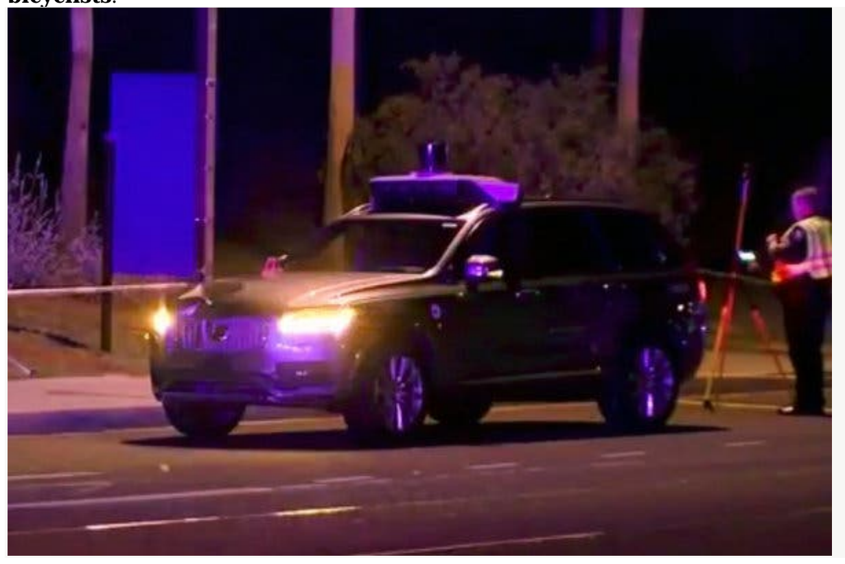
A self-driving Uber car at the scene of a fatal accident in Tempe, Ariz.

In a news release, the National Transportation Safety Board said it was sending a team of four investigators to examine "the vehicle's interaction with the environment, other vehicles and vulnerable road users such as pedestrians and bicyclists."