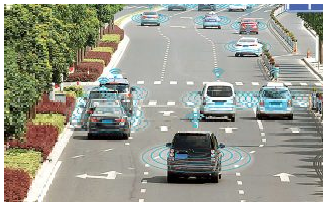
Εκτιμάται ότι για να είναι πλήρως εφαρμόσιμη η τεχνολογία της αυτόνομης οδήγησης, θα χρειαστούν 30 χρόνια (φωτ. Shutterstock).