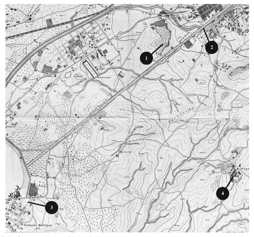
MAP 2: Syngrou Avenue in 1908.

esteemed excursionists. The point here is the description of genuinely new experiences and possibilities. The main experience brought forward by this new innovating kind of 'promenade' was the 'annihilation of space by time', no longer as the general tendency of capitalist transport systems, but as a concrete individualized feeling.<sup>27</sup> We can now better comprehend the political significance of Prince Nicholas' speed record, namely that from the point of view of the upper class, machinery-based speed signalled the possibility of the abstraction of space, and thus of a new