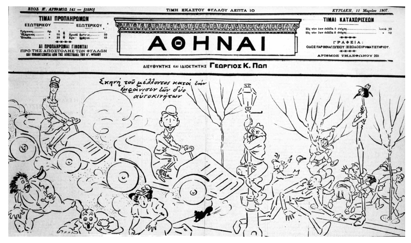
FIGURE 1: A future scene.

Satirical representation of the Streets of Athens, published on the front page of Athinai newspaper, one week after Froso Kalogera's death. The caption reads: 'A future scene during the appearance of the two automobiles'. The effort given to fully depict Athens' class stratification is obvious. Yet, the most ill-disposed towards the new automotive machines is the barefooted man angrily climbing the lamp post, and the gamin to the right who, as usual, is mocking the automobilists.